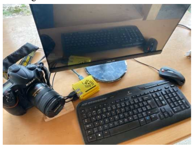
Fig. 5. The final set of the photo booth

The final set of the photo booth. In Fig. 5, we can see all the hardware components connected. The total cost of new components for the photo booth we have built (without the cabin) would be about 750 Euros. The estimated price of the photo booth cabin made of wood would be approximately 250 Euros. Its design is displayed in Fig. 6 – its dimensions are 60x60x23cm, estimated weight is about 13 kg.