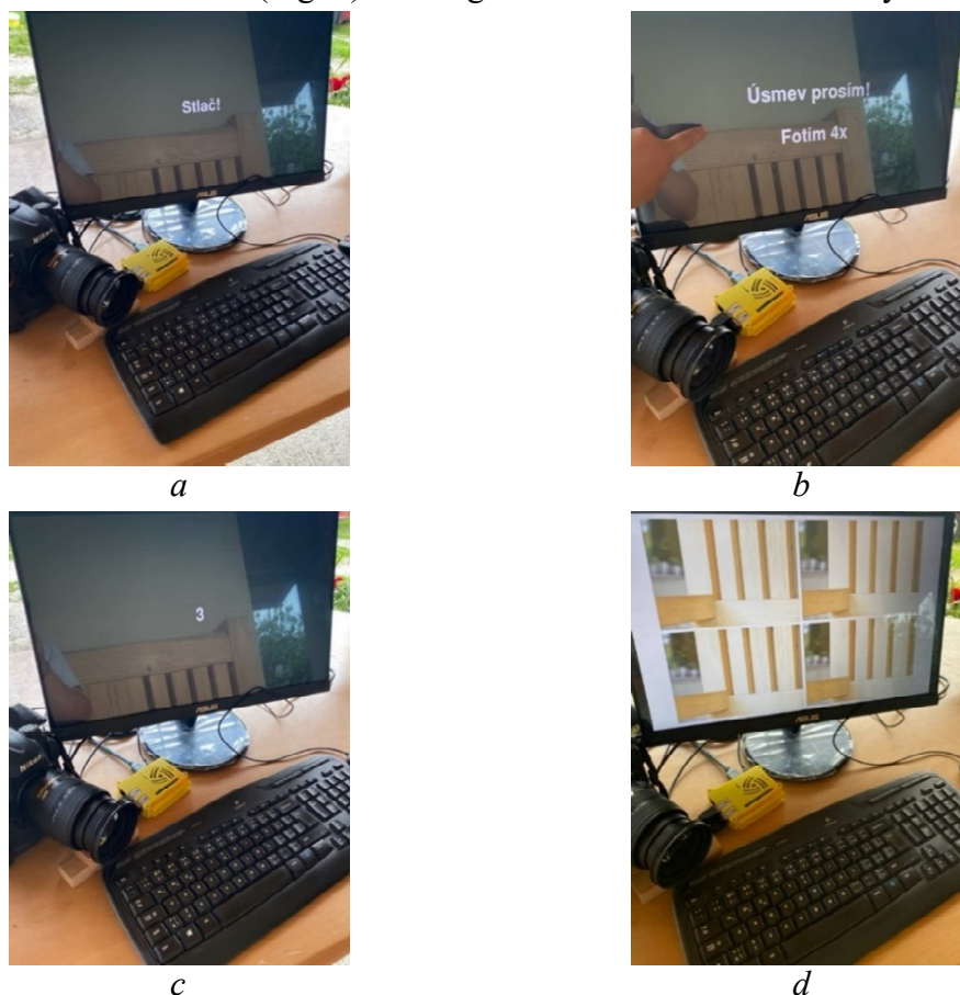
Fig. 8. Practical test [12]

Testing functionality of the photo booth. After starting the program, the number of photos was set, for example, of four pieces. A preview of the captured object was displayed. When the shooting was activated, the program counted down and took a picture. This cycle was repeated four times with a 5 seconds pause between each shoot. As a result, four photographs were taken. They were compiled into a collage according to our prescribed rule, then displayed on the monitor and saved on the RPi disk (Fig. 8). Testing verified the full functionality of our solution.