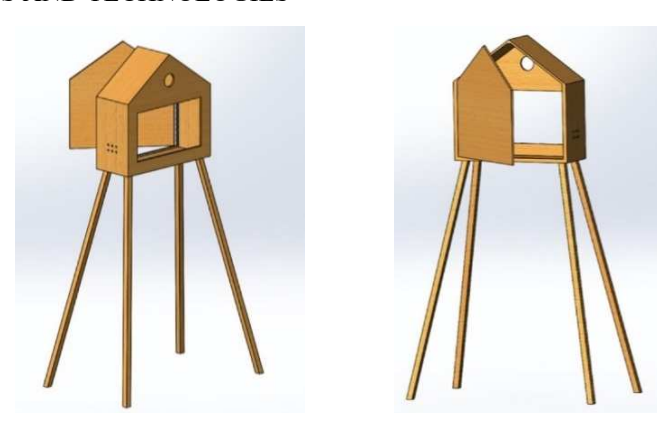
Fig. 6. Design of the case of the photo booth: front and back view

Our solution - software. The Python programming language was used to create a control program for our photo booth. It is a universal programming language that is used to create modern applications related to data analysis, media processing and other operations. This programming language works on various platforms such as Windows, Linux, Mac or even Raspbian. In our specific case, we used Python version 3.7.3 [8; 9; 10]. The resulting program has the task of providing communication between RPi, camera, monitor, mouse, keyboard, or printer, respectively implement photo sending to mail/internet storage. An important function is also communication with the user of the photo booth via the created GUI.