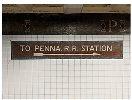
Figure 2 – Abbreviations in modern time (New York's Subway)

Abbreviations have some advantages and disadvantages.