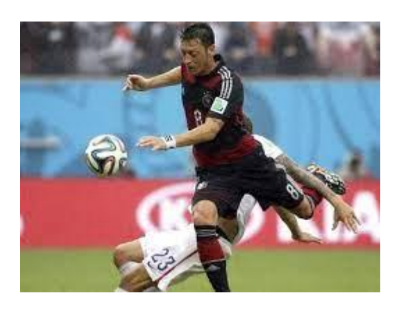
Unit 22 World Cup Athletes Consider Fasting During Ramadan

Discussion Question : Do you choose organic food over non-organic food at the grocery store? Which types of food are you most careful about buying?