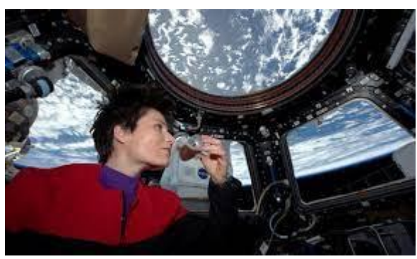
Unit 14 Space espresso

Discussion Questions : What type of food do you find revolting? What puts you off about it, and how would you describe its taste and smell? What food have you acquired a taste for?