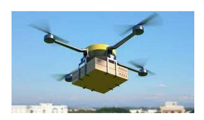
Unit 20 Pizza Delivered By Drone

Discussion Questions : Does this type of news make you nervous about the future of food? What can the average person do to help ensure that other crops don't go extinct?