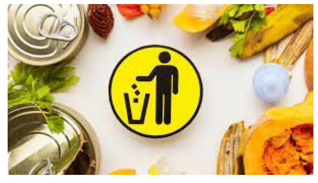
Unit 24 Innovative Company Tackles Food Waste

Discussion Questions : Do you still carry cash on an everyday basis? How long do you think it will be before physical currency is no longer in circulation in your country?