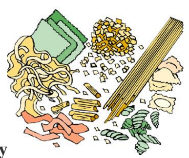
Unit 6 "Spaghetti" Means Little Strings

Discussion Questions : Are you addicted to the caffeine in coffee, tea, or soft drinks? What happens to your body if you don't get your "caffeine fix"?