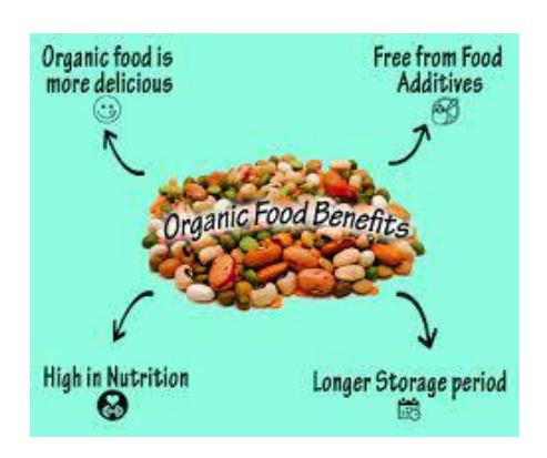
Unit 21 Organic Foods Have Same Nutritional Value