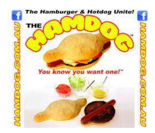
Unit 18 Hamdog Is World's First Patented Burger

Discussion Questions : Would you try a beer yoga class? Why or why not?