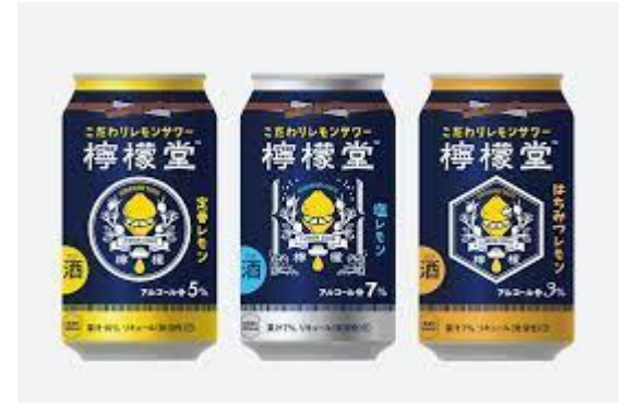
Unit 16 Coca-Cola To Launch Alcoholic Drink in Japan

Do you celebrate Mardi Gras? If so, what kinds of traditions do you have? If not, what other holidays do you celebrate, and what kinds of traditions do you have for those holidays?