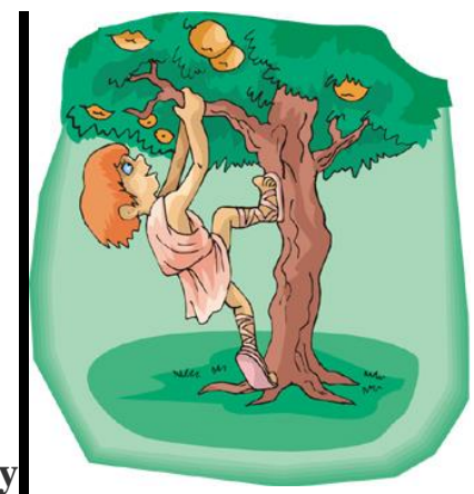
Unit 12 The Colour Orange Was Named After The Fruit

Discussion Questions : Pringles cans are iconic around the world. What other packaging is easily recognized by its unique shape or appearance?