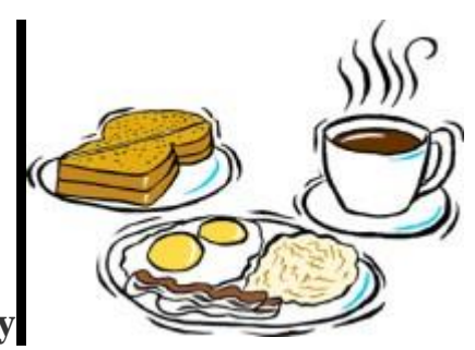
Unit 4 An English Breakfast Is A Full Breakfast

Discussion Questions : What's your favourite type of baked good? Do you know the origin of your favourite treat?