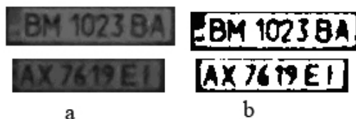
Fig. 2. Source and binarized images of license plates

The results of binarization by this method are shown in Fig. 2.