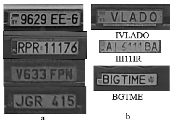
Fig. 6. Correctly (a) and incorrectly (b) recognized license plates

Conclusions. This method successfully copes with the task of license plate recognition with confidence 95-99 %. But as the test results show the method has several drawbacks. First, this method does not easily recognize the “garbage” in the image and often confuses it with the symbol ‘I’. Second, on the dirty license plates or on false detection this method repeatedly uses alternative recognition which leads to a significant load on the processor.